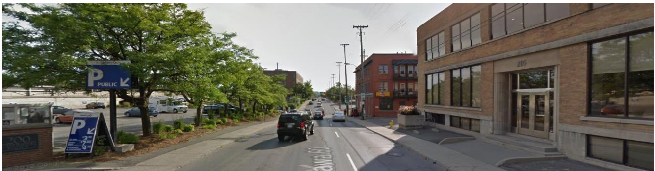
Image above is heading West on Catherine Street toward Bank Street (between Bank and O'Connor) Public Parking at 200 Catherine on Left | 205 Catherine on Right